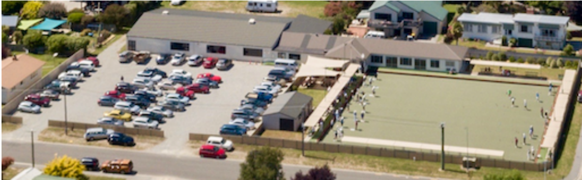
Fulton Hogan Wanaka Classic Men's 4s Invitation Tournament 2020

There will be a full field of 16 teams entered, including some composite teams that include a number of well performed bowlers from Wellington, Dunedin, Southland, Nelson and Central Otago, as well as Wanaka Bowling Club members.